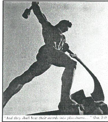
Old World symbol of peace, now reality!

He described the Renaissance, the Industrial Revolution and the final series of